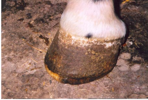
Fig 2. Good condition hoof .