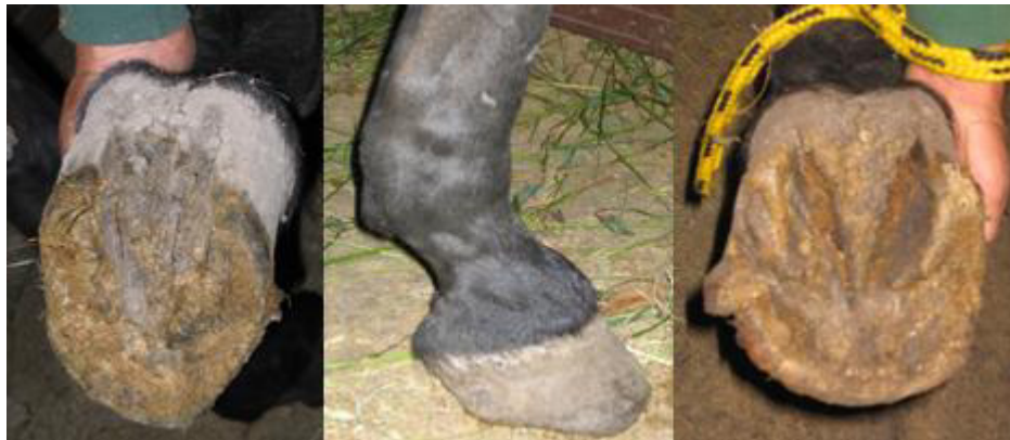
Fig 5. Septic frog in three hoofs