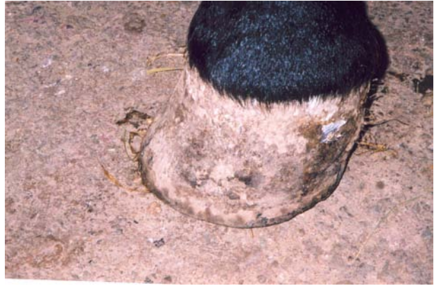
Fig 3. Poor condition hoof.