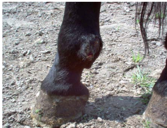
Fig 4. Wounds origin from slope hoof