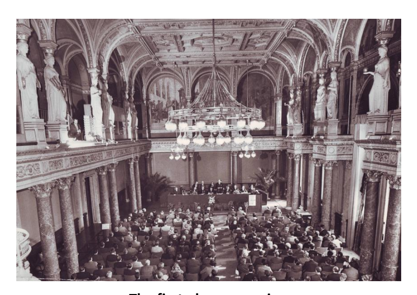
The first plenary session

He demonstrated the mutual interactions between development of animal hygiene as science and practice of modern husbandry systems. He had foreseen that large-scale production had been and remained the engine of the agricultural progresses. Summarising the then available information he nailed down: genetic progress is accompanied by the parallel increase of housing, nutritional and other relevant requirements of domestic animals and poultry. Disregarding these connections sets basis for development of multifactorial diseases. He introduced the concept of "living environment" and demonstrated the necessity of its balance with the defence mechanisms of animals. Dealing with the connections between animal behaviour, housing and development of abnormal behaviour, he stated: "Be-