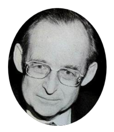
Prof. Hans G. Hilliger

Hans Georg Hilliger (Hannover, Germany-West) was elected as a President of the Society and asked to organise the 5<sup>th</sup> Congress. This 5<sup>th</sup> Congress was held in the Congress-Centrum of Hannover between the 10th and 13th of September 1985. By the mid-eighties increasing number of evidence proved that the biggest loss in animal farming was due to the (sometime considerable) gap between the genetic capacity of livestock and poultry and the actual production realised in field condition. Therefore, overviewing of those factors that decrease the production efficiency of farm animals became timely and the Congress in Hannover addressed the problem very successfully. The text of the 133 oral presentations was published in two volumes of the Proceedings (840 pages).